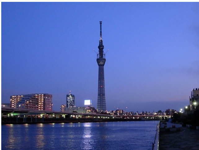
Tokyo Sky Tree

These changes for 2015 are still just a suggestion at this point. To encourage more discussion and get further feedback, we hope to run these ideas past Tokyo area LD members once the October 19 deadline for proposals for Creating Community: Learning Together has passed. We are looking forward to hearing SIG members' views and to reporting in further detail for the LD SIG AGM at JALT2014.