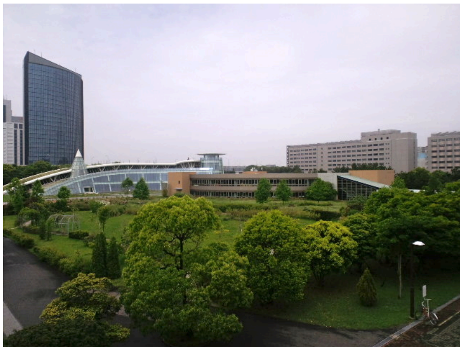
Library and Self-Access Learning Centre (SALC) at Kanda University of International Studies

Source: http://en.wikipedia.org/wiki/Kanda_University_of_International_Studies#mediaviewer/File:Kanda_University%27s_SALC_and_Library,_Spring_2010.jpg