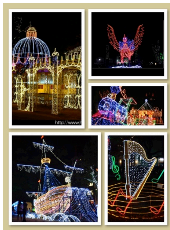
Winter illumination is coming to Hiroshima soon!

ideas. sharing resources, reading suggestions, etc.", while another reminds us that in some ways our purpose is to supplement, or complement, what our wonderful Hiroshima JALT chapter meetings do: "Unlike JALT Hiroshima monthly meetings, the LD get-together is a more friendly and relaxing small society, so participants can express their feelings, opinions, complaints about teaching and learning more freely. From their casual conversation, I learn a lot of small things. The accumulation of these small informations are more valuable to me than formal academic ones. I hope this get-together will create mutual understanding between teachers and learners." To be honest, I don't think we do a lot of complaining, but as well as everything else it is, our get-togethers are a place to let off steam and appreciate each other as a community of teachers and learners.