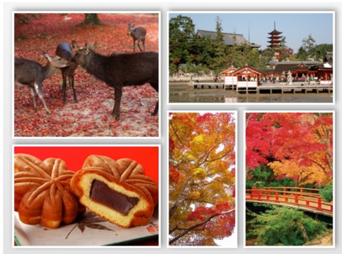
Autumn in Miyajima