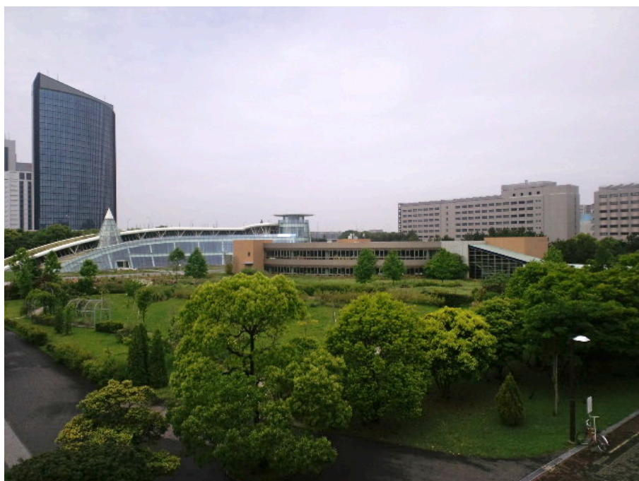
Library and Self-Access Learning Centre (SALC) at Kanda University of International Studies

Source: http://en.wikipedia.org/wiki/Kanda_University_of_International_Studies#mediaviewer/File:Kanda_University%27s_SALC_and_Library_Spring_2010.jpg