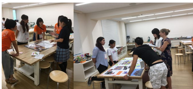
Participants engaged in the poster session

The conference was divided into three poster sessions. The participants rotated every 6 minutes to new posters, allowing them time to listen to most of the presenters. At the end of each rotation, participants were able to ask questions. Next, students formed groups in a reflective activity to discuss what they learned or what they found was the most helpful or most interesting.