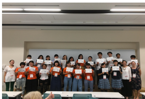
Presenters at the Learners about Learning Conference September 2018

To conclude the conference, student presenters were given certificates of achievement and a group photo was taken at the end. ILA participants were invited to look at the posters and have further discussions with the students. Also, student presenters were asked to write a 500 to 2500 word paper for the ILA Conference Proceedings.